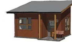
H Dustrud Architecture 263 sf