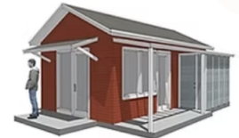
S Fifield Architecture + Urban Design 265 sf