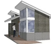
N DMc Architecture Honn Design + Construction 208 sf