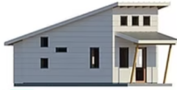
E Rainbow Valley Design + Construction 288 sf