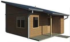
A Nir Pearlson Architect 256 sf