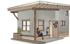
Q dirtChic Builders 200 sf