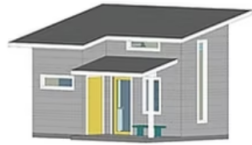
C Bergsund DeLaney Architecture + Planning 160 sf