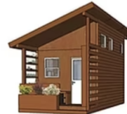
U SquareOne Villages 160 sf