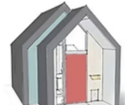
M Campfire Collaborative Architecture & Design 198 sf