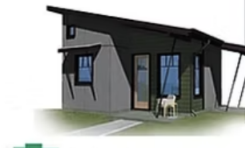
J Arbor South Architecture 236 sf