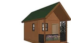
L SquareOne Villages 160 sf