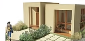
P Urban Collaborative 273 sf