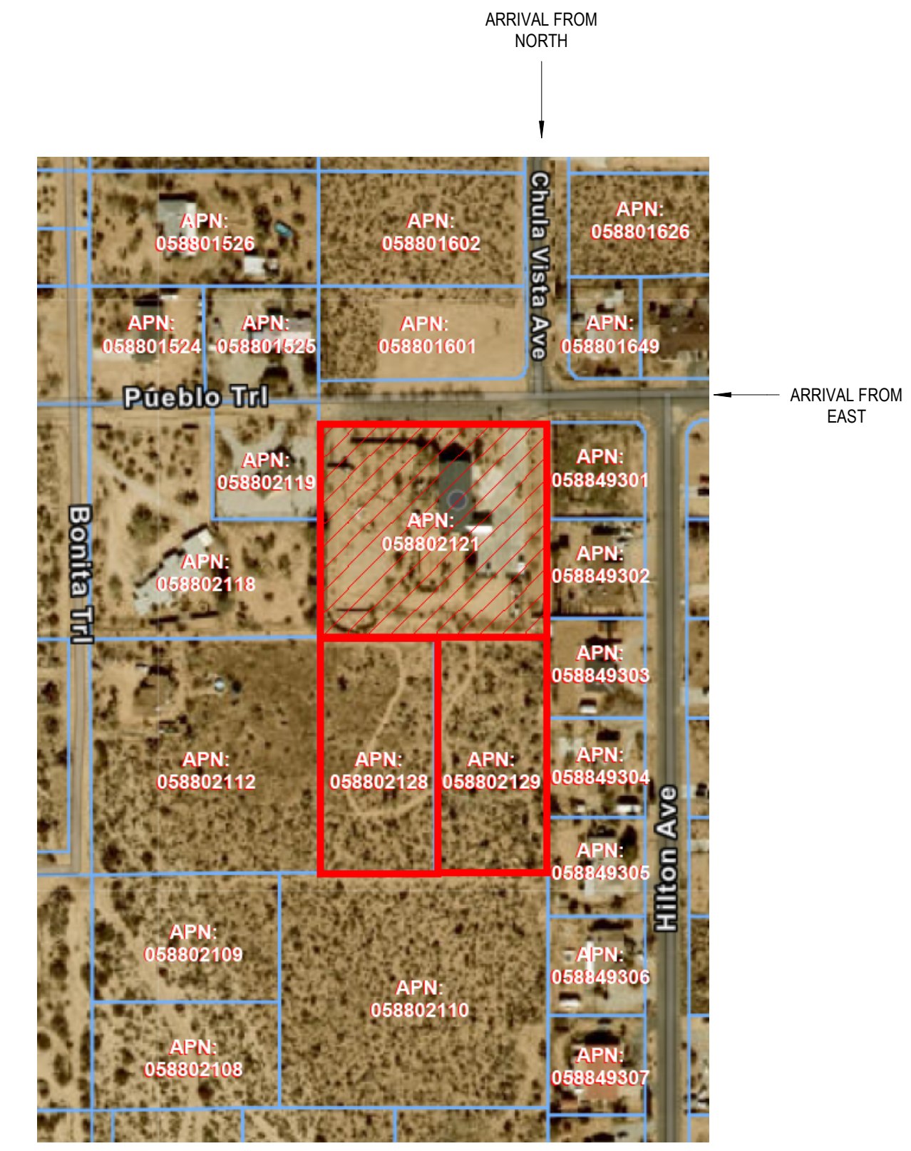
SITE PLAN 02 1" = 20'-0"