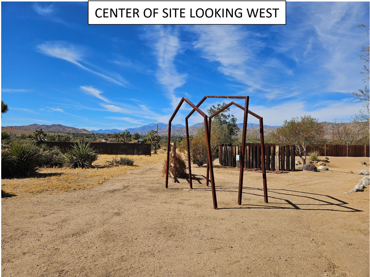
FIGURE 3, cont: PHOTOGRAPHS OF SITE