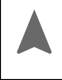
Figure 2: Vicinity Exhibit Produced By: RCA Associates Inc.

SW of the Intersection of Pueblo Trail and Chula Vista Ave. in Yucca Valley, CA.