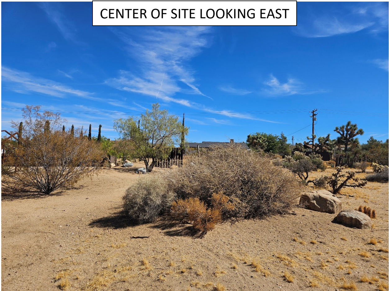
FIGURE 3: PHOTOGRAPHS OF SITE