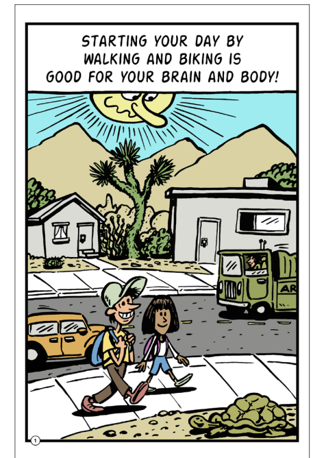
Figure 2.4.1. Morongo Basin Active Transportation Zine (Cover & 1st page). Illustrated by Matt Adams